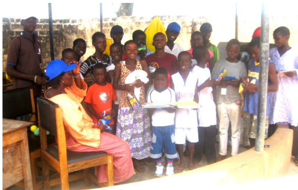
These orphans in Ghana are really happy with their gifts Thank You Chew Magna School

School bags Books Pencil cases Pens, pencils, crayons etc Baseball hats Clothes Toys