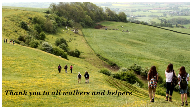
Thank you to all walkers and helpers

Walkers raised over £1,000. A great day, sunshine, fantastic scenery and a cream tea