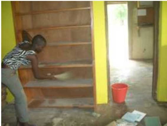
The library starts to take shape.